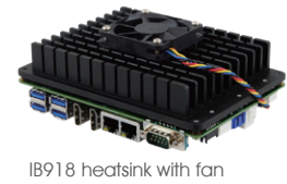
IB918 heatsink with fan