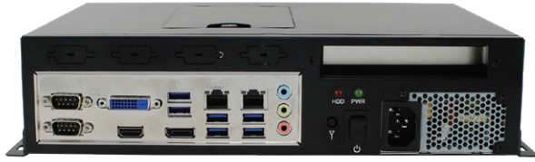
Rear I/O (Based on MI992VF-7820 & MI991 & MI990 I/O)