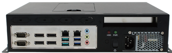
Rear I/O (Based on MI989 I/O)